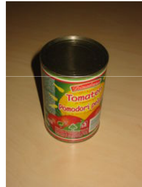
A can of preserved food